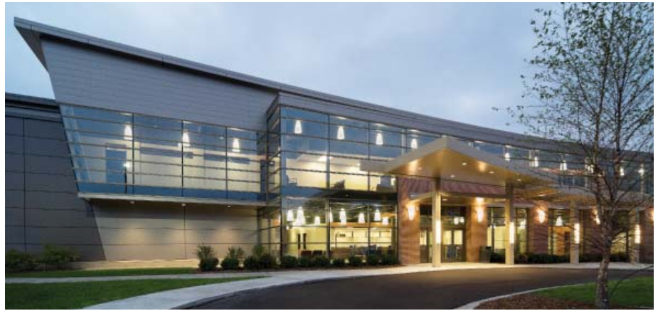
Family Health Center - Patterson Clinic