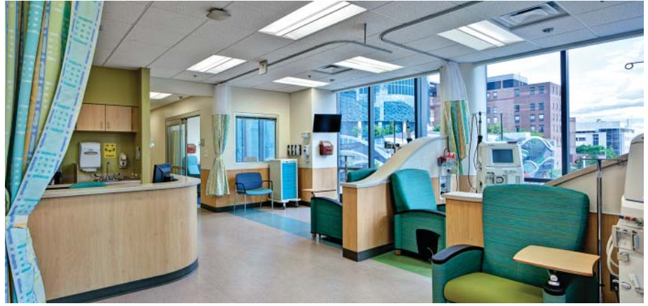
Spectrum Health - Helen DeVos Ambulatory Pediatric Clinic