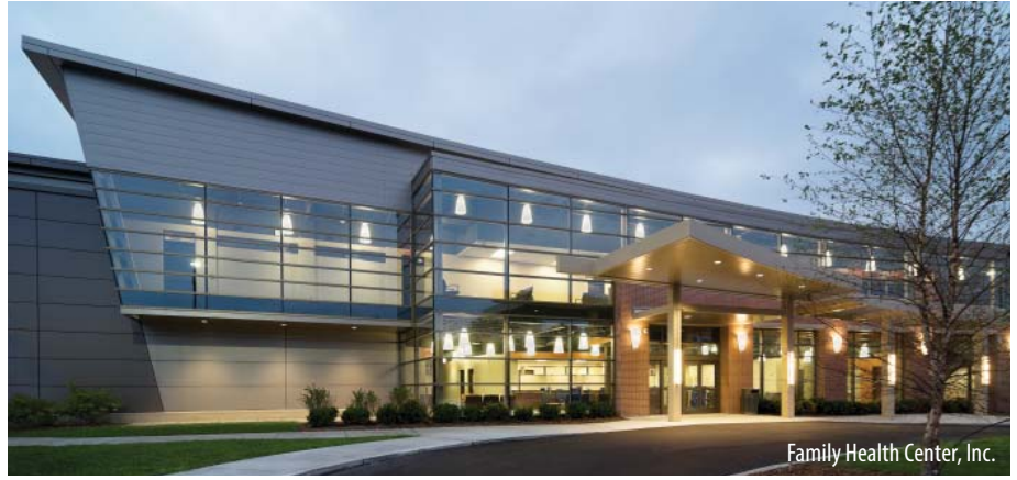
Family Health Center, Inc.