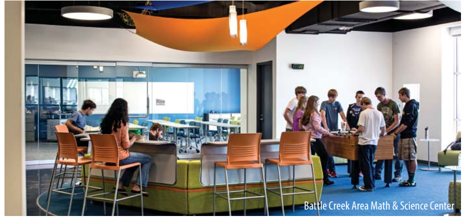
Battle Creek Area Math & Science Center