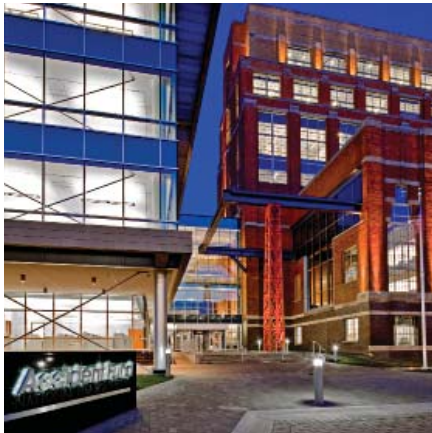
Catalyst Development - Corporation Hall