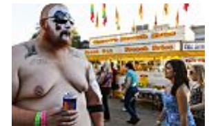
Common Ground 2013 - Thursday