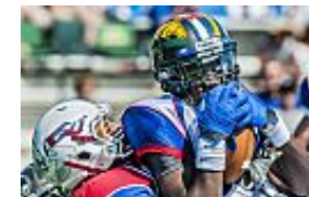
High School All-Star Football Game